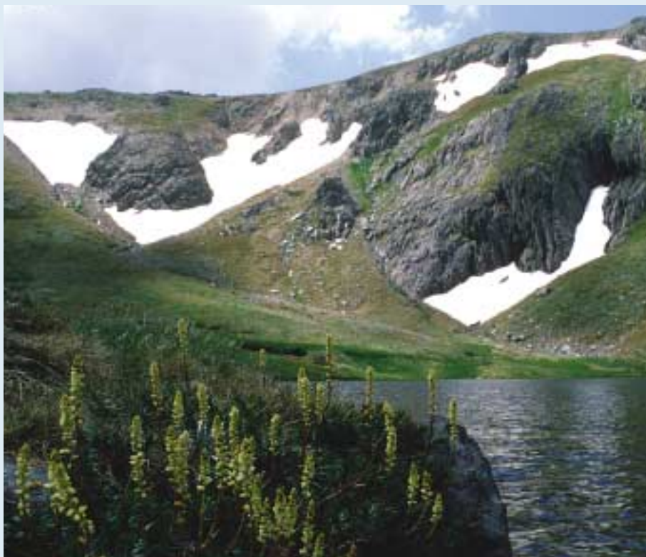
Candle Health ( richea continentis ) at Club Lake, Kosciuszko National Park, NSW.